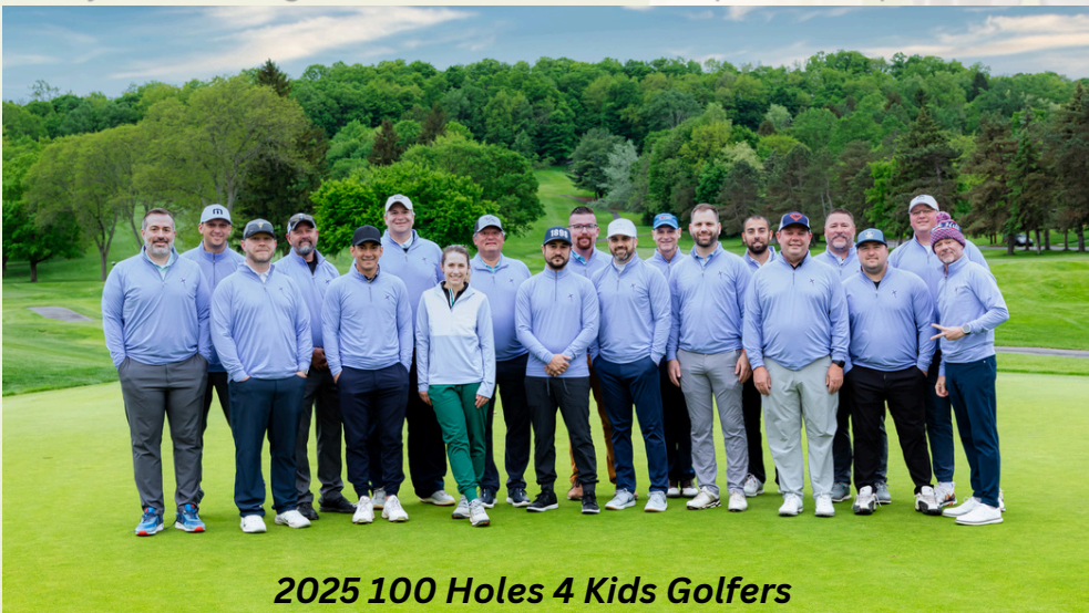
2025 100 Holes 4 Kids Golfers

100 Holes 4 Kids is quite the atypical charity golf tournament. It is a unique fundraiser with 20 committed golfers, who start their day at 6 a.m. and play 100 continuous holes of golf, finishing up 12 hours later. The golfers are sent out in twosomes to play each round of 18 holes at a 2-hour, 10-minute pace. Each golfer is tasked with raising a minimum of $3,000 starting at least three months prior to the event. Will you consider being a part of this noteworthy cause by committing to one of the available sponsorships?