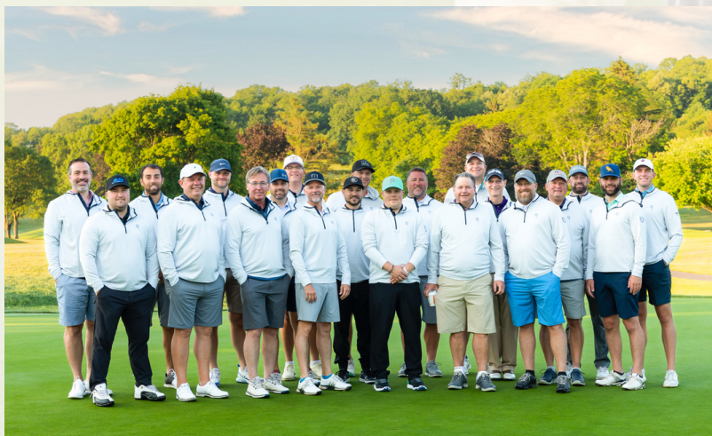
2023 100 Holes 4 Kids Golfers

100 Holes 4 Kids is quite the atypical charity golf tournament. It is a unique fundraiser with 24 committed golfers, who start their day at 6 a.m. and play 100 continuous holes of golf, finishing up 12 hours later. The golfers are sent out in twosomes to play each round of 18 holes at a 2-hour, 10-minute pace. Each golfer is tasked with raising a minimum of $3,000 starting at least three months prior to the event. Will you consider being a part of this noteworthy cause by committing to one of the available sponsorships?